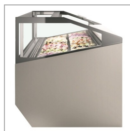
Glass end walls as standard